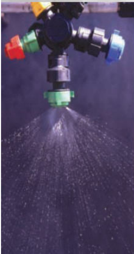
Airborne spray drift at 7.5 gal/ac – spraying speed at 15 mph

"Spray droplet characteristics weren't perfect for the VariTarget nozzles, but they were close and remained similar across a range of speeds typically used in an application," explains Storozynsky. "We found that spray quality remains pretty consistent over a range of speeds, since the pressure range is so small. We