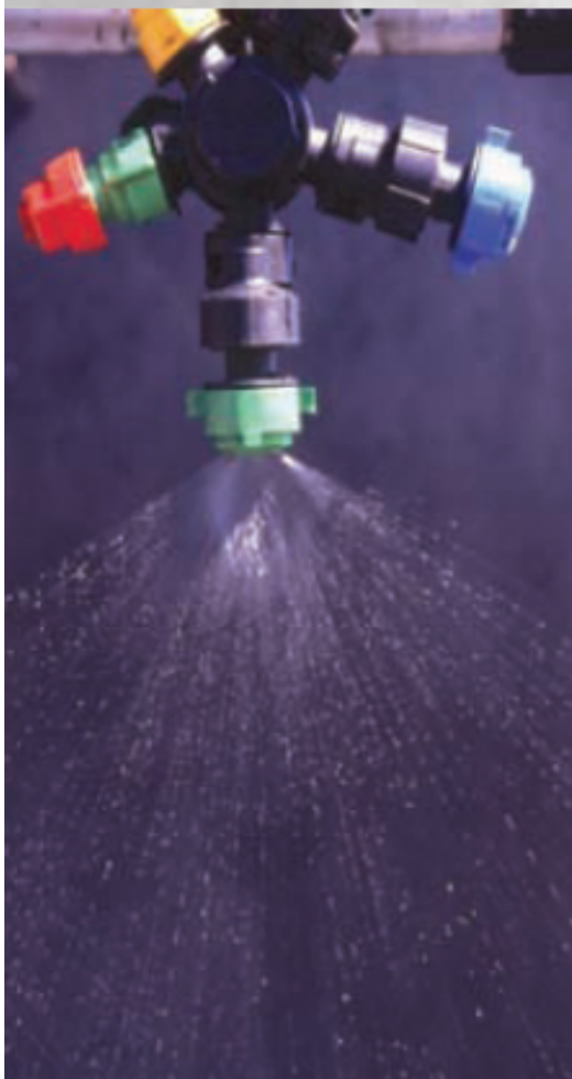
Airborne spray drift at 7.5 gal/ac – spraying speed at 15 mph

"Spray droplet characteristics weren't perfect for the VariTarget nozzles, but they were close and remained similar across a range of speeds typically used in an application," explains Storozynsky. "We found that spray quality remains pretty consistent over a range of speeds, since the pressure range is so small. We